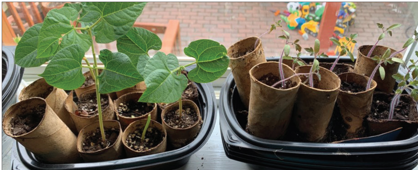
Roxana Mondragon-Motta's winning photo: "Our toddler twins took empty paper towel rolls and turned them into seed starter pots for our urban garden. These are tomato and green bean plants (sitting in reused takeout containers near our window)."

Wilson Sonsini is committed to becoming a more sustainable organization throughout both its domestic and international offices.